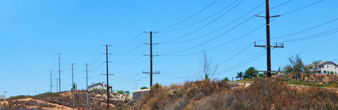
View of the existing condition as seen from Suzi Lane, east of Shree Road, looking north.