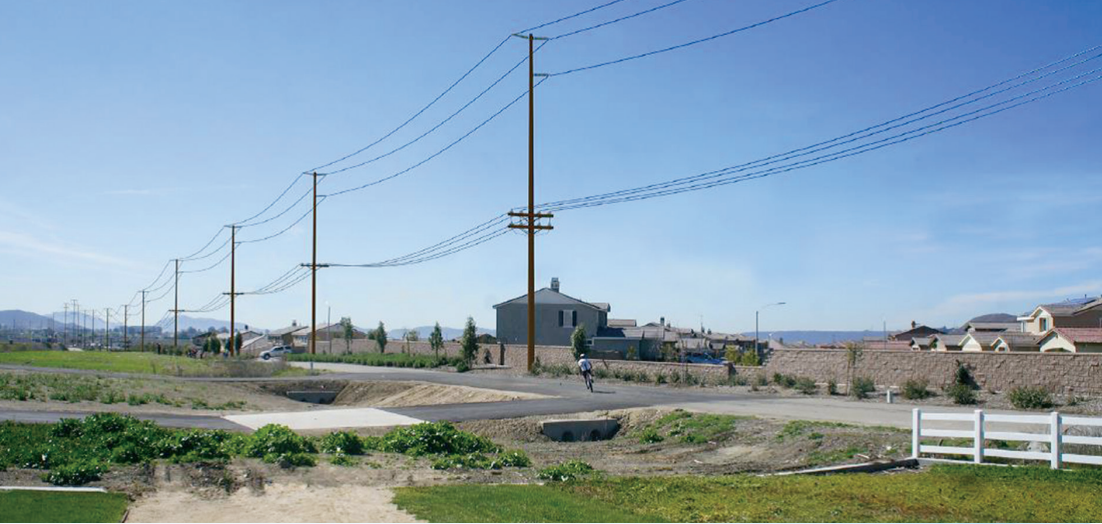
Simulated view of the proposed project from a neighborhood trail along Old Leon Road, looking southwest.