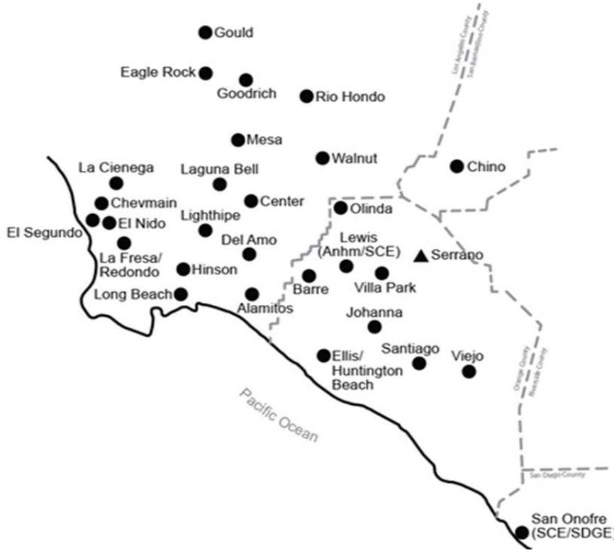
Figure I-2 Indicative Locational Effectiveness Factors Based on Mitigation of the West of Serrano Substation Constraint