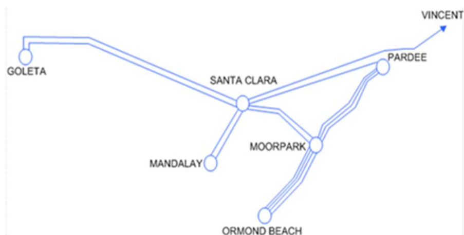
Figure II-3 Moorpark Subarea A-Bank Substations