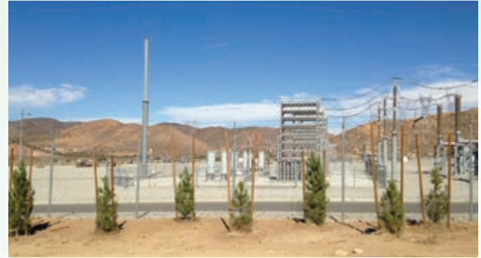
Earlier this year TRTP installed trees around the Vincent Substation.

For a summary of construction updates during the next three months, please see the Upcoming Construction Activities section inside this newsletter or visit our project website at www.sce.com/trtp .