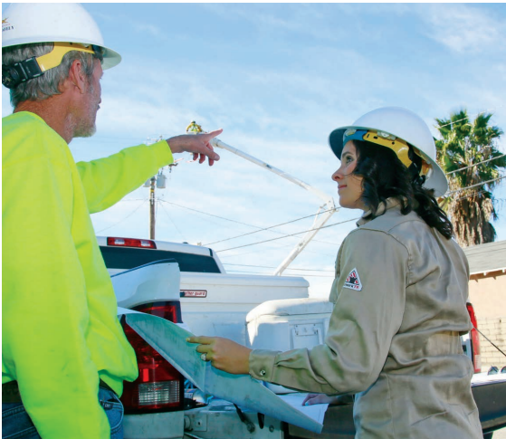
The project, which is in initial planning, will follow standards of the California Public Utilities Commission.