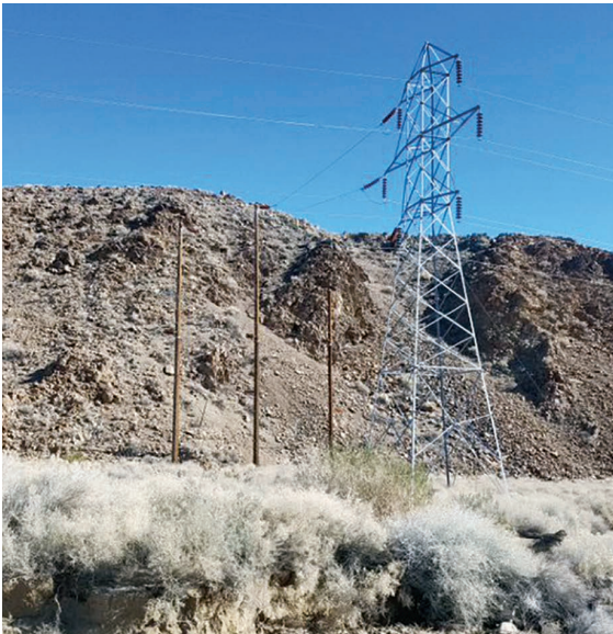
The Ivanpah-Control Project will enhance safety in portions of Mono, Inyo, Kern, and northern San Bernardino counties.