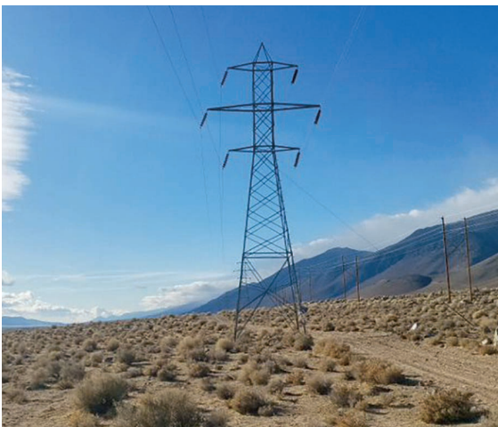
SCE will work with the Bureau of Land Management to protect environmental and recreational resources during construction.