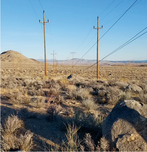
The Control-Silver Peak Project will enhance safety of SCE's sub-transmission system in portions of Inyo and Mono counties.