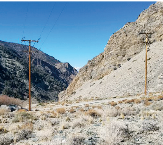
SCE will work with the Bureau of Land Management and Inyo National Forest to protect environmental and recreational opportunities.