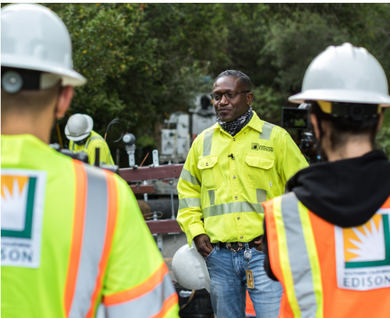
The project, which is in initial planning, would follow standards of the California Public Utilities Commission.