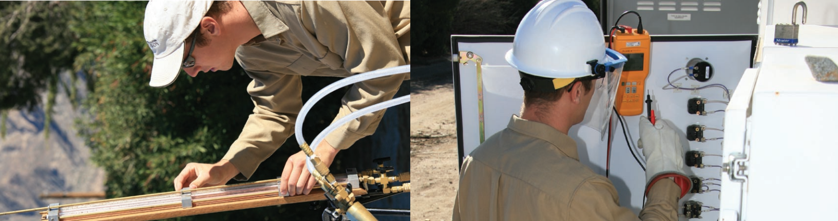
Express Solutions, AP-I and Free Pump Testing from SCE Help The City of San Bernardino Municipal Water Department Maintain Quality and Save Money